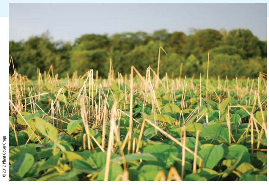
In this field, soybeans are growing up through the stubble of a rye cover crop. Cover crops like this one protect and improve the soil, suppress weeds, and capture excess fertilizer, reducing pollution.

Organic agriculture in particular borrows heavily from the agroecological approach. In place of chemical pesticides and fertilizers, certified organic farmers must rely on healthier soil and more-diverse ecosystems to produce safe, abundant food. These methods have been refined through scientific investigation of the interactions within ecosystems, and sometimes use cuttingedge technologies to achieve results.